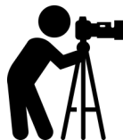
NO VIDEO CAMERAS OR CAMERAS WITH LENSES GREATER THAN 6"