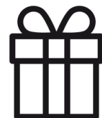
NO WRAPPED GIFTS

All carried items and entrants are subject to search. Prohibited items must be returned to the owner's car or discarded. Any unlawful items are subject to confiscation, and the person in possession of such item is subject to arrest. Items left at the door will be discarded.