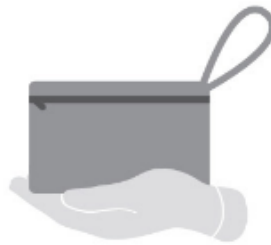
6.5" X 4.5" SMALL CLUTCH PURSE