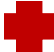
ITEMS RELATED TO A MEDICAL CONDITION