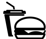
NO OUTSIDE FOOD OR BEVERAGES