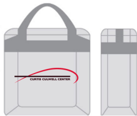
12" X 6" X 12" CLEAR TOTE