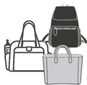
NO PURSES, BACKPACKS, & DIAPER BAGS