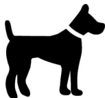
NO ANIMALS EXCLUDING CERTIFIED SERVICE ANIMALS